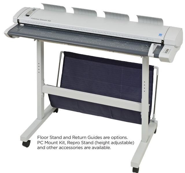
Floor Stand and Return Guides are options. PC Mount Kit, Repro Stand (height adjustable) and other accessories are available.