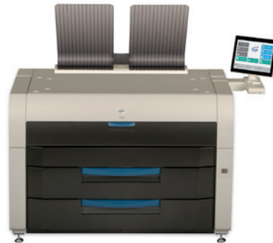
Single Footprint KIP 7770 Print System