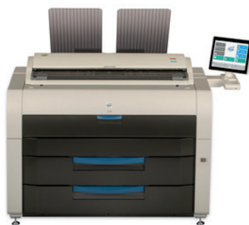
Single Footprint KIP 7770 Multifunction System