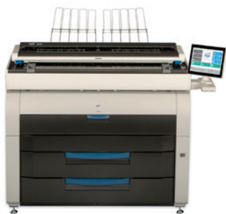
Single Footprint KIP 7770 Production System